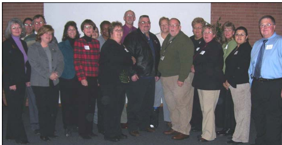
2007 Leadership Committee